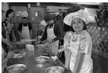
Cooking with Kids Weekend