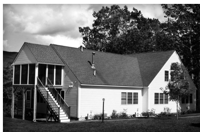
The Olde Farmhouse

The Annex and Guest House were both large three-bedroom units, so the Farmhouse was built with larger families in mind. It can accommodate at least four families, sometimes more depending on the configuration. All the units have their own entrances, but units 1 & 2, 3, and 6 can connect internally. Farmhouse 1 & 2 have a living room with a fireplace. Farmhouse 4 & 5 is a two-bedroom unit and has a living room with a fireplace. Farmhouse 6 was added after the original completion of the building. This unit was going to be storage, but instead was turned into another guest accommodation with two bedrooms, one bathroom, and a private screened-in porch.